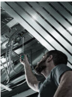
Secure hold and easy removal

The 300 mm long blade makes it possible to reach even low lying couplings.